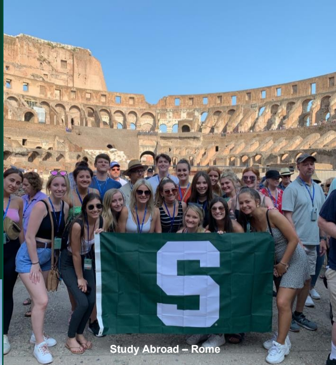
Study Abroad – Rome